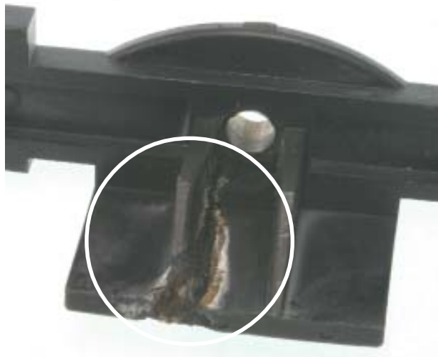
Unacceptable (Developing bearing bar failure)