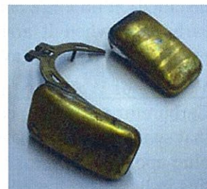
Brass Float (REPLACE)