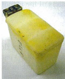
HA White Float (REPLACE)