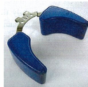
GOOD Large MA Float (BLUE)