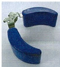
GOOD Small MA Float (BLUE)