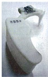
MA White Float (REPLACE)