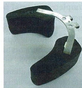
MA Black Foam (REPLACE)