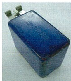
GOOD HA Float (BLUE)