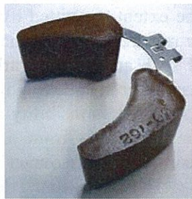
MA Brown/Beige Foam (REPLACE)